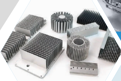
Heatsink Aluminium Sections