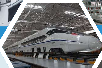
Railway & defence industry