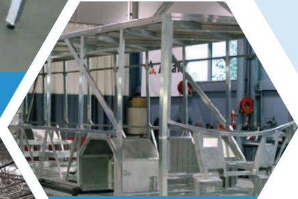
Bus Body Aluminium Profiles