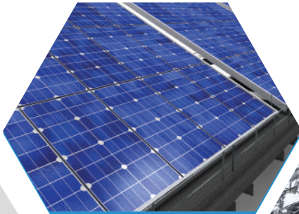
Solar Panel Aluminium Extrusions